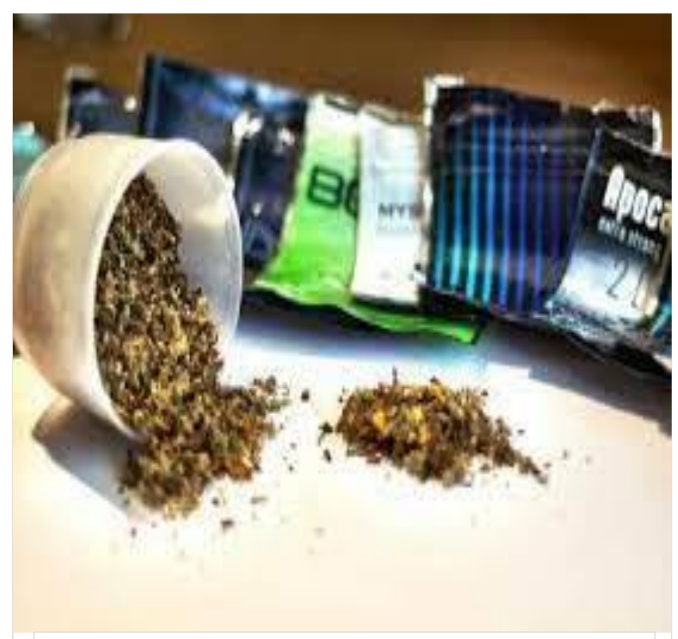
Emerging drugs of abuse! 12/05/2021, Retrieved from https://medicalxpress.com/news/2013-10-emerging-drugs.html